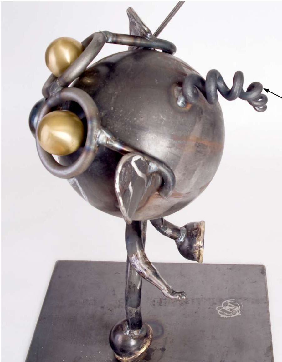
A oxygen acetylene torch was used to modified the Forge Steel Spiral Topper (Item No. 13-3013-491)

The brass sphere was attached to the head using a threaded stud. Both the brass sphere and head were drilled and tapped for the studs. The stud was solder to the head to prevent it from turning. The solder in the stud's threads was removed by a wire brush while the solder was still in a molten state.